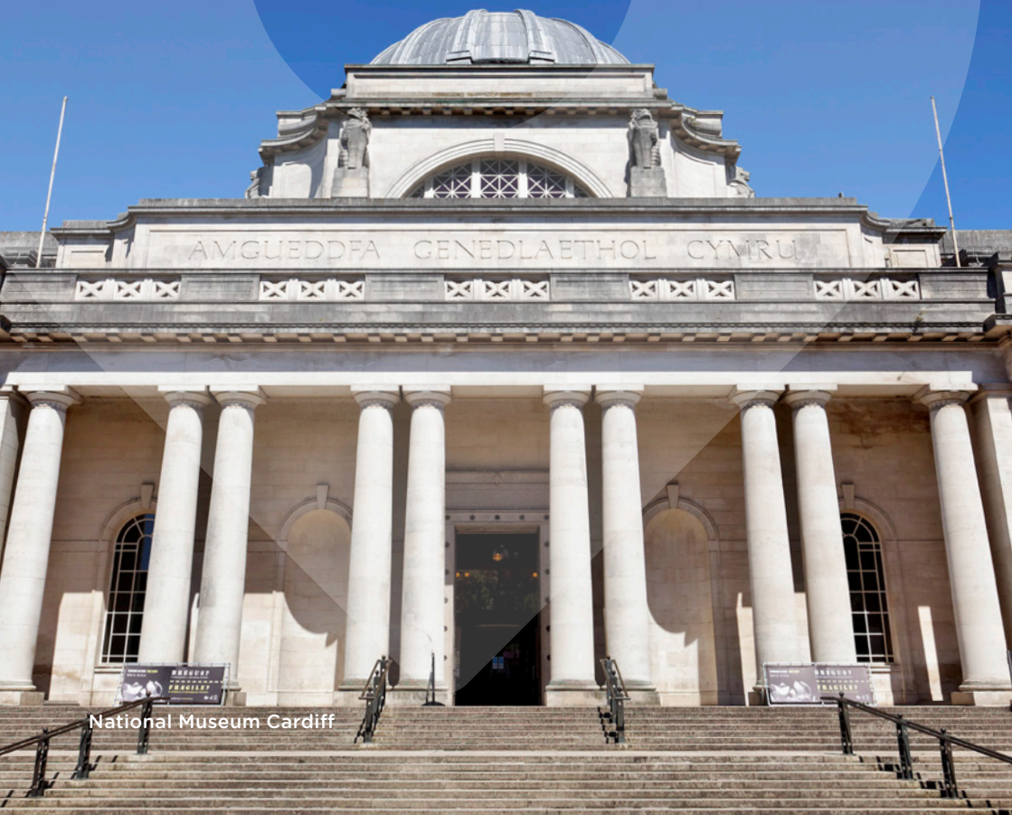
National Museum Cardiff

With so much to do, it can be challenging to know where to start. Here's a sample of a two-day itinerary, highlighting places that you can easily explore in the timeframe.