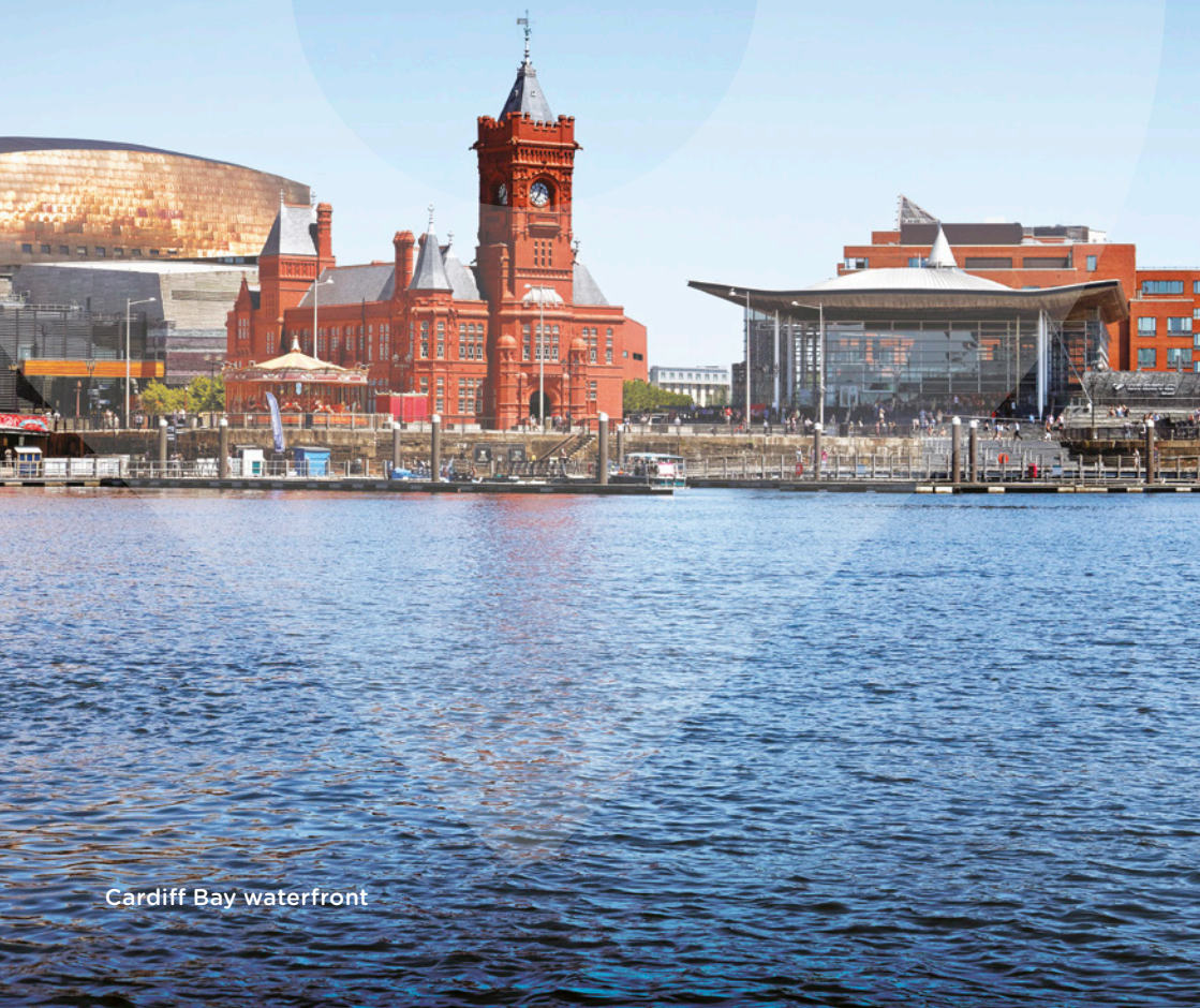
Cardiff Bay waterfront

After breakfast hop on your bus and travel the short distance to Cardiff Bay.