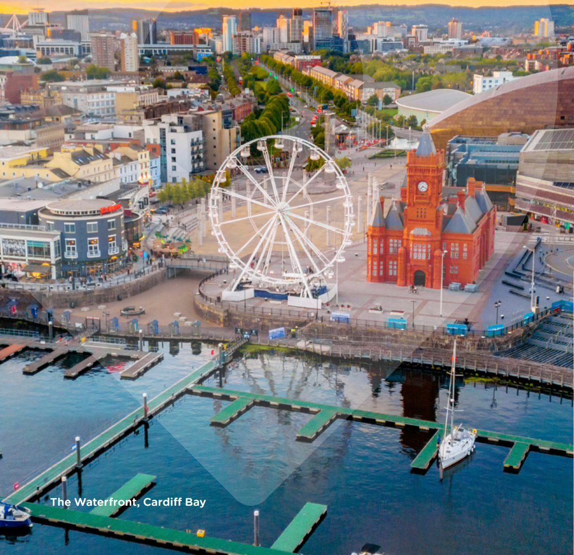
The Waterfront, Cardiff Bay