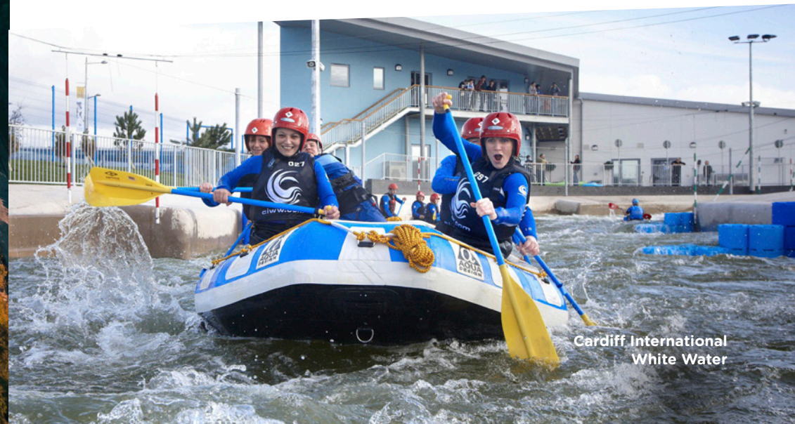
Cardiff International White Water

The circular trail for cyclists and walkers is 10km (6.2 miles) long. It runs around the Bay and across to the seaside town of Penarth via Pont Y Werin, a 140m bridge providing a link for pedestrians and cyclists between Penarth and the International Sports Village.