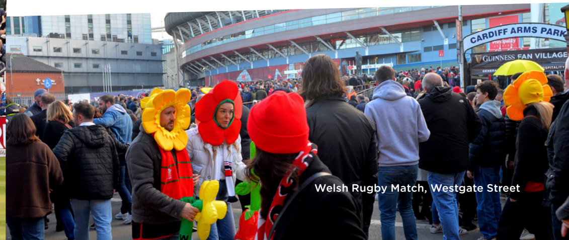
Welsh Rugby Match, Westgate Street

Cardiff is no stranger to cricket, we played host to the ICC Cricket World Cup in 2019. We're also home to Glamorgan Cricket, the only first-class cricket club in Wales and play their home matches at Sophia Gardens in Cardiff City Centre.